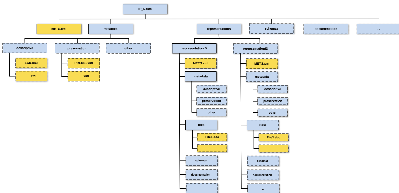
Figure 1: IP Folder Structure

The CSIP folder structure and its requirements is visualised in the figure below: